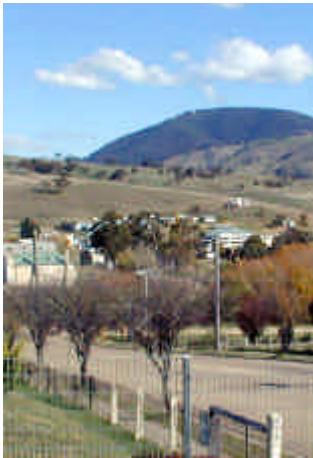
Omeo Township Far East Gippsland, Australia

The Multi-purpose Services program and Healthstreams are two flexible funding programs introduced into the Australian health care funding system in the 1990's to give small rural communities having difficulty supporting a range of independently run services the opportunity to develop a more coordinated and cost effective approach to service delivery. The Multipurpose Services model works on a model of health and aged care service delivery that aims to help small rural and remote communities to tackle some of the challenges they face, such as being restricted in coordinating services because of tradition funding guidelines. The Healthstreams program was established in 1996 as an incentive to small rural hospitals to develop a broader range of community based services. Both programs lift funding barriers that had previously restricted service options. Services now have the ability to develop flexible services more appropriate to their communities highest needs.