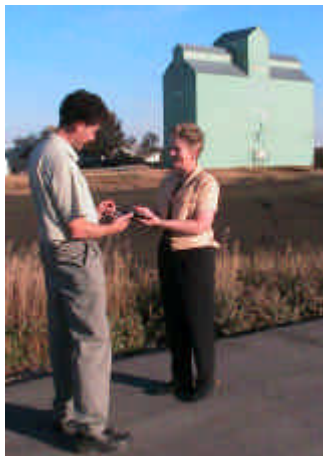
Beaming with Pride – information sharing in rural Alberta

Alberta Rural Physician Action Plan has successfully integrated information and communications technology into its rural teaching practices. Collaborating with the University of Calgary and several technology partners, RPAP's Information Technology program provides equitable access to many resources such as the Virtual Library, handheld computers for learners and teachers, Information Technology support, and collaborative data exchange. Over 9 years, many innovations have enabled rapid distribution of information; unique research tools with automated data collection have provided better feedback to policy makers thereby improving our programs. All this has been achieved at low cost by focusing on key information pathways and by adoption of innovative cost-sharing mechanisms.