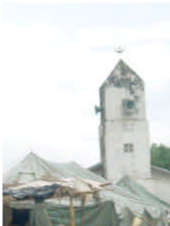
Unhcr - Oru Refugee Camp, Oru, Ijebu-North Local Government of Ogun State in Western Nigeria

Refugee camps are usually located in rural communities worldwide. Over five thousand refugees from war-torn areas of Africa notably Liberia, Sierra-Leone, the Democratic Republic of Congo, Sudan, Cameroon and Rwanda have been resettled in this camp about 2 hours drive from Lagos which was established under the auspices of the United Nations High Commissioner for Refugees.