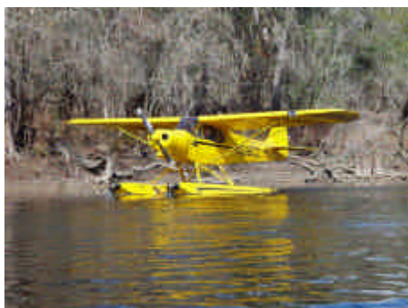
Northern Ontario is a vast area with many remote communities accessible only by air

Two family medicine residency programs were established in northern Ontario, Canada in the early 1990's with a mandate to train family physicians to practice in northern Ontario and rural settings. An initial assessment of these programs conducted in 2002 found that the two programs had been successful in producing a sizeable number of family physicians that work in northern Ontario, rural, or small-town settings.