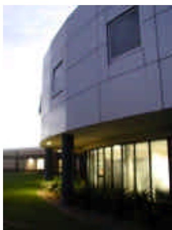
Monash University Australia

Monash University School of Rural Health is a success story in Rural Health Research. Over a 10-year period, the School undertook a series of research projects, the results of which have contributed to policy development in Rural Health Workforce and Rural Health Services. Examples include: A series of studies on Models of Health Service Delivery in Rural and Remote Communities, including a focus on sustainability; Recruitment and Retention of the Rural health Workforce including Doctors, Nurses and Pharmacists; and Urgent Care Services in Rural Communities.