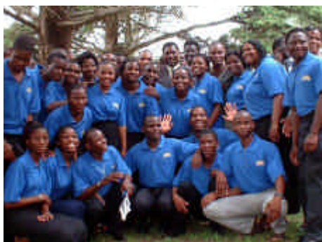
Scholarship Scheme Students

The Friends of Mosvold Scholarship scheme is a partnership between the local community, Department of Education, Department of Health, Medical Education for South African Blacks and private funders. The ultimate aim of the project is to provide high quality health services to the indigent population of Ingwavuma by the identification, training and support of local students who have the potential to become health care providers.