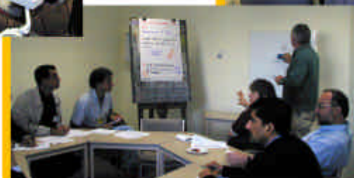
WHO-Wonca Co-sponsored Invitational Conference. Small Group Workshops.