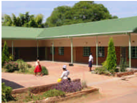
Bertoni Photo: Courtesy of Ian Couper

The Integrated Sustainable Rural Health Development Program is currently being implemented as part of the change process occurring in South Africa and addresses many of the challenges facing all key stakeholders involved in bring about these changes and encourage the development of partnerships in meeting new health objectives in South Africa.