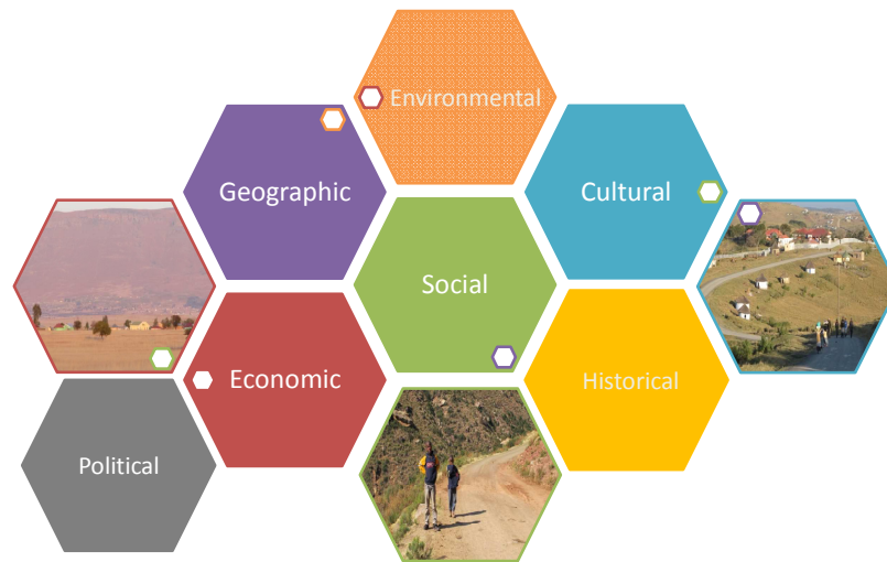
Diagram 2: Perspectives of the rural context

Environmental elements of the rural context include agriculture, mining, forestry, fishing, wilderness and recreational areas, in addition to more dispersed patterns of settlement. In developing countries, agricultural areas are often distinctly divided between commercial farms as private businesses, and subsistence agriculture through communal or tribal ownership by indigenous peoples. In developed countries there is also a contrast between family-owned farms and corporate farms operated by employees for the benefit of distant shareholders. These different forms of environmental use directly influence patterns of prosperity or poverty, and hence health and illness. In addition, wilderness areas generate their own patterns of ill-health through natural disasters and injuries; for example many rural hospitals have to cope with large numbers of major road traffic injuries where high speed roads pass through rural areas.